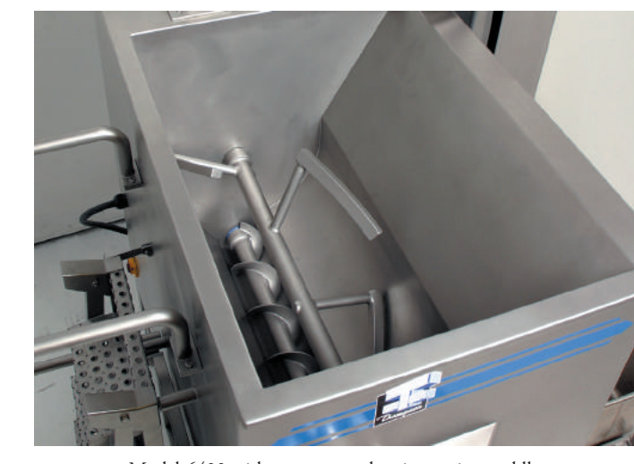
Model 6400 with programmed reciprocating paddle.