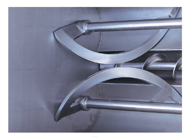
Mixing ribbon option